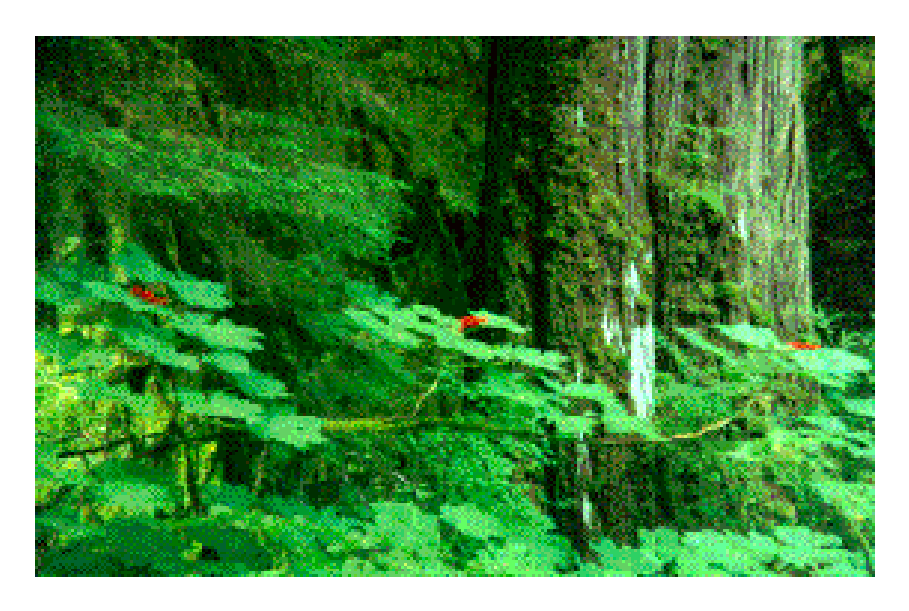
"Everybody needs beauty as well as bread, places to play in, where nature may heal and cheer and give strength to body and soul alike"